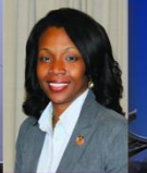
Commissioner Lisa Cupid

SATURDAY, AUGUST 26, 2017 10:00AM- 2:00PM