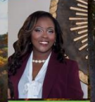
Commissioner Fabrice Fagan

SATURDAY, SEPTEMBER 9, 2017 10:00AM- 2:00PM