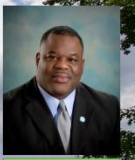
Commissioner Bruce Holmes

SATURDAY, SEPTEMBER 9, 2017 10:00AM- 2:00PM